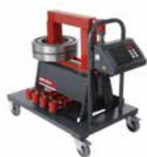
38 ZFD cap. 300kg

BETEX® is a registered trademark of Bega Special Tools