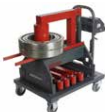
40 RSD cap. 350kg