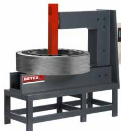
GIANT cap. 3500kg