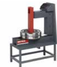
SUPER cap. 600kg