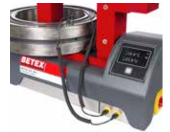
Dual temperature sensing (monitoring \Delta T )