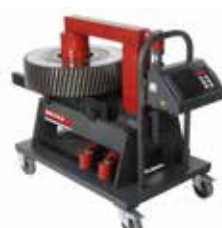
40 RMD cap. 600kg