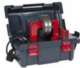
Induction heater Betex portable BETEX BLF 200